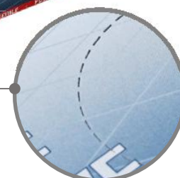
Perforated package to facilitate use